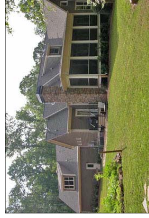
Side & Rear View