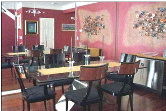
Dining Room w/ Mirrored Accent